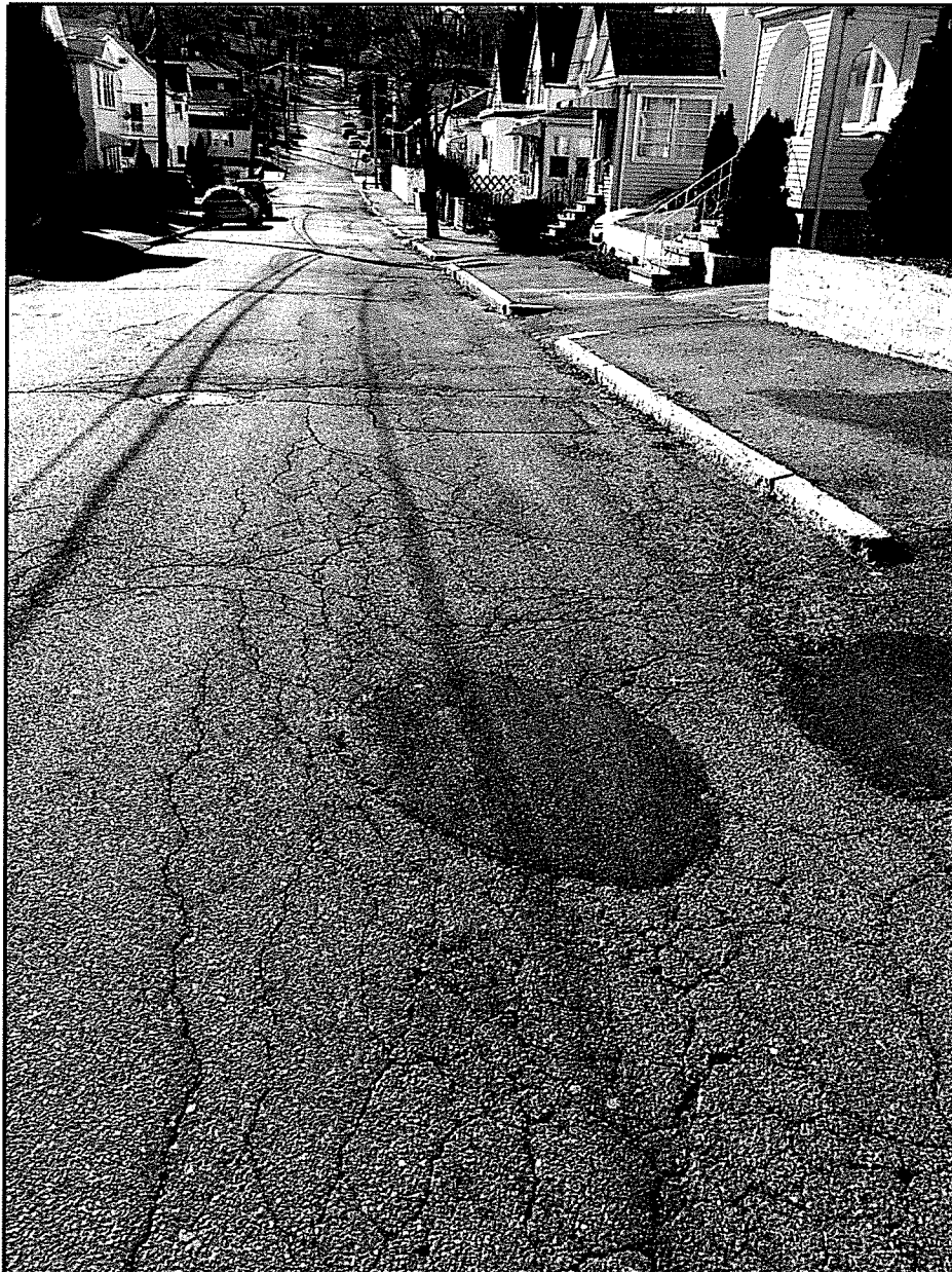
Photo shows poor condition of roadway. Extensive settlement, alligator cracking and pothole repairs. Condition of the road base is questionable.

Looking south towards Park Ave. (One driveway south of last picture)